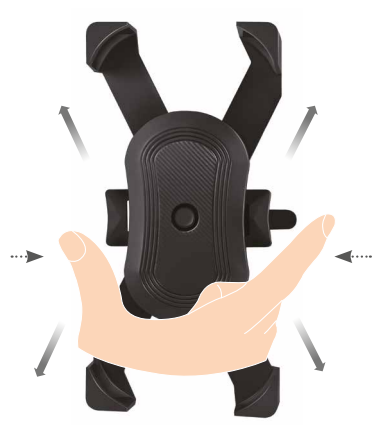
Place smartphone on the holder and push down to lock.