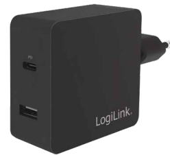
PA0212 USB-C 45W PD Port

Charge your power-hungry devices with one 45 W or 65 W USB-C port and one 2.1 A fast charging USB-A port.