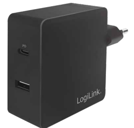
PA0213 USB-C 65W PD Port