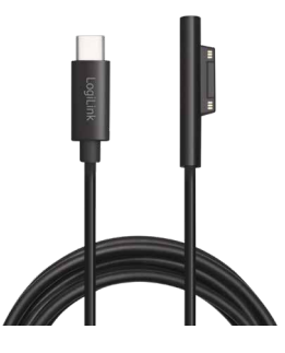
PA0224 USB-C<sup>™</sup>to Microsoft ®Surface Charging Cable