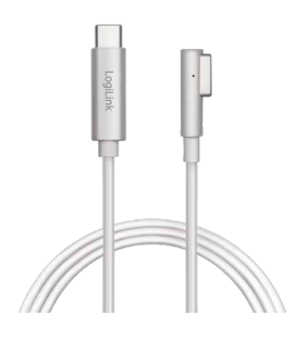
PA0225 USB-C<sup>™</sup>to Apple MagSafe® Charging Cable