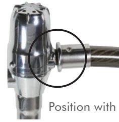
Position with Alarm

SC0211 is equipped with an alarm function. When the alarm function is active, an alarm is sounded for about 10 seconds if the lock is vibrated (such as during an attempted theft). The alarm is sounded again following each subsequent vibration.