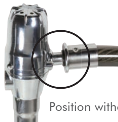
Position without Alarm