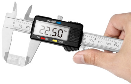
External Diameter Measurement