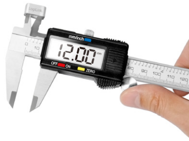
Internal Diameter Measurement